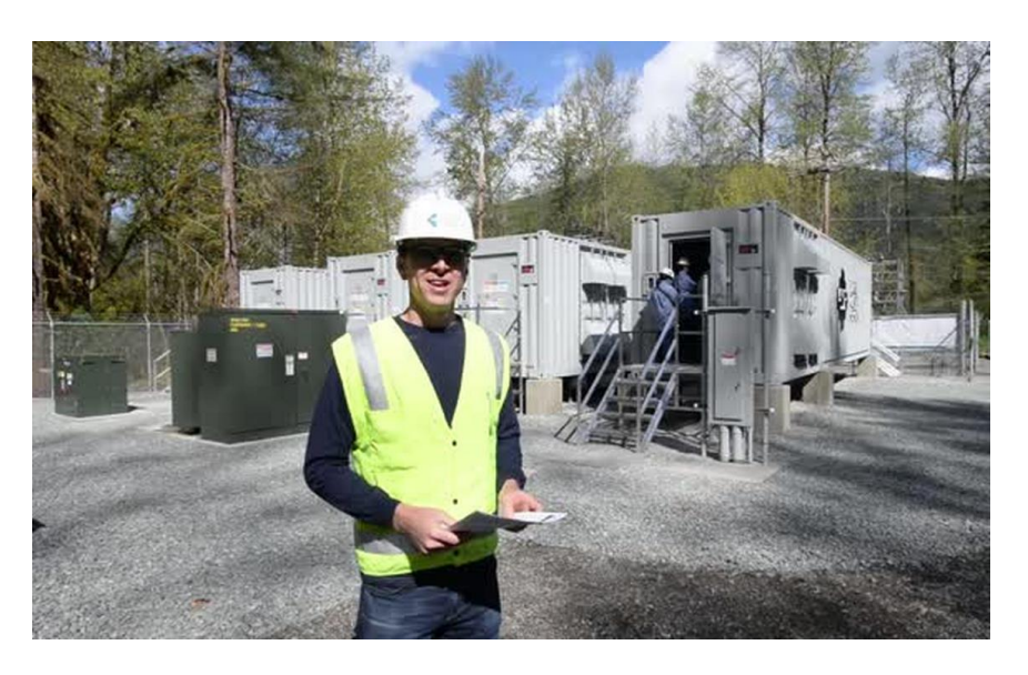
Bellingham Herald - 2016